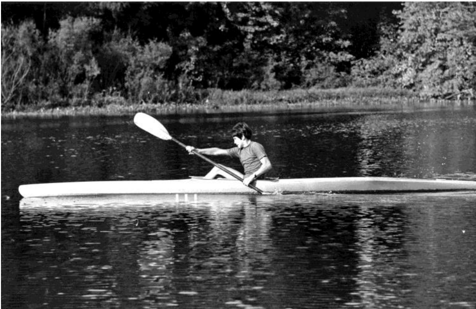
Greg Barton paddling K1 in 1972