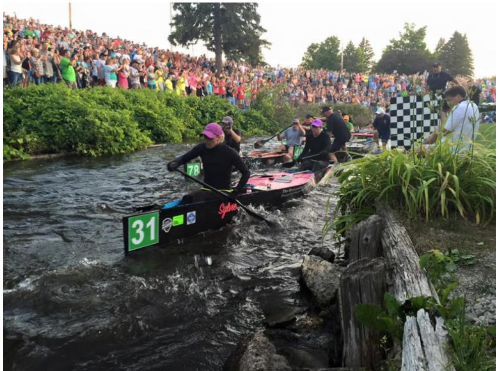
Excitement at the start of the AuSable River Canoe Marathon

Practice “jumps” during training. That is, practice accelerating the canoe sharply to maximum speed from a normal race pace and hold that maximum speed up to twenty seconds. Changing speeds quickly is a skill that every competitive paddler needs to develop.