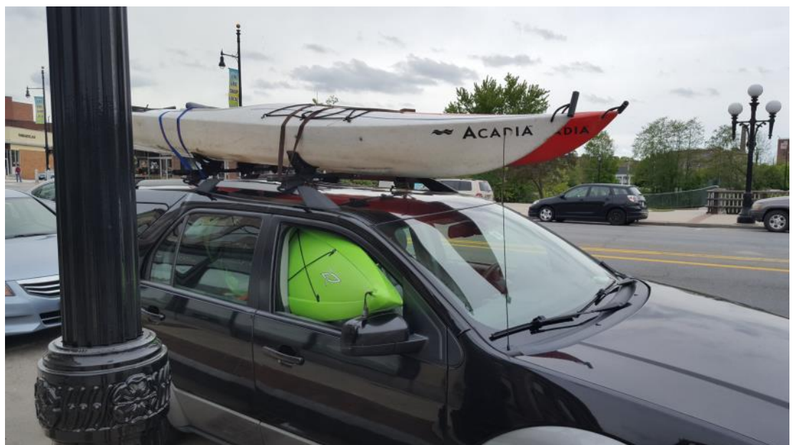
Loaded for Nationals...sort of!

Even if the only reason you are coming to Northfield, MA this summer is for the challenge of racing against some of the best canoe and kayak racers in North America, we are sure you will not be disappointed. The grounds are beautiful and the Connecticut River is a spectacular venue for Nationals.