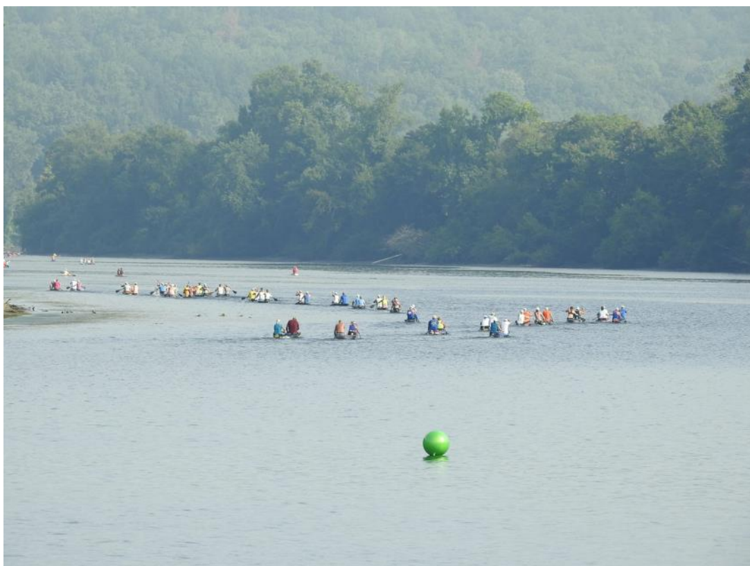
Paddlers moving up the Connecticut River towards Pomeroy Island during the 2016 USCA Nationals.