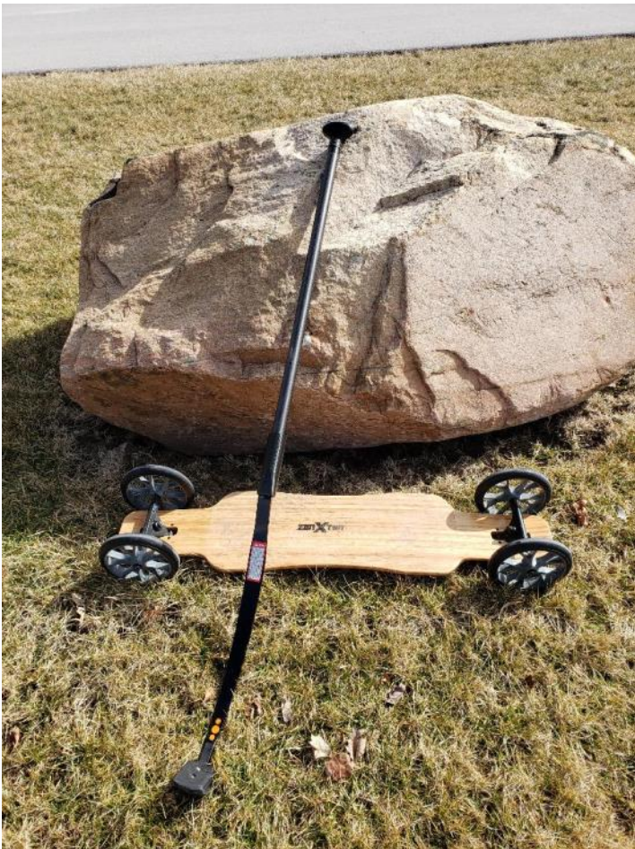
Top Left: My ZenXTen Big Wheel board and BraapStik land paddle; a potent combination when the roads are rough.