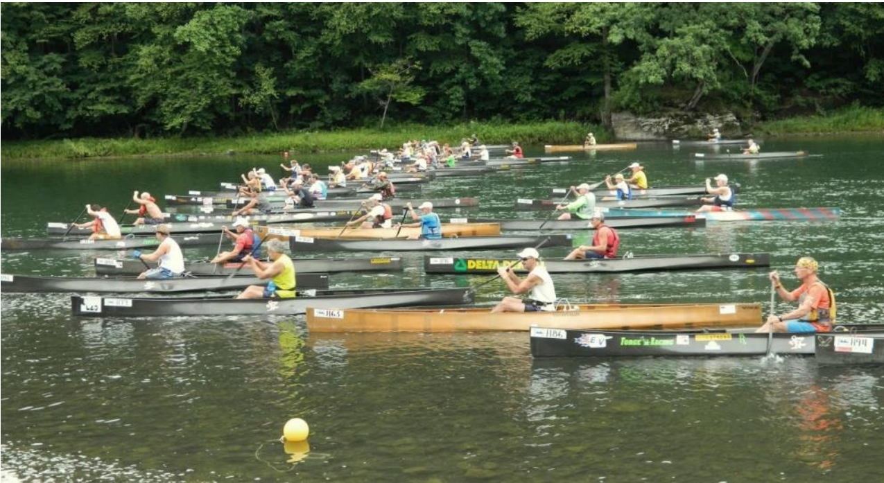
C1 Race Start at the 2012 Nationals in Warren, PA 53 canoes were on the line!

With the USCA Nationals postponed for a year, we thought it would be fun to post a few classic photos for readers to enjoy.