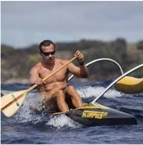
Paddling the Scorpius!

came out with the Ares, and to our surprise the Ares suited a wide variety of paddler weights. Ozone's version of the Ares was pretty identical to the hull we developed in Hawaii, so I was very pleased with it. The Ares has become a very successful design for a wide range of paddlers, from beginners to expert and heavy to light weight paddlers.